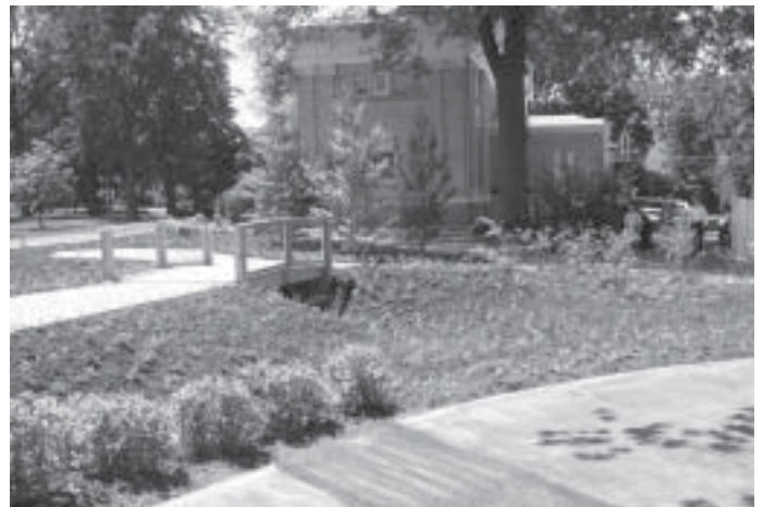
Rain Garden at Delaware Valley College

Even though most college students had already vacated their dorm rooms, the campus of Del Val was anything but quiet on June 11. Representatives from Doylestown Township, the League of Women Voters (LWV), Bucks County Conservation District, Delaware Valley College and several community members were gathered to dedicate the recently installed rain garden.