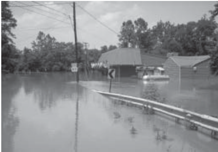
Flooding on River Road in Kintnersville in 2006.

-Observations after a storm on October 4, 1877