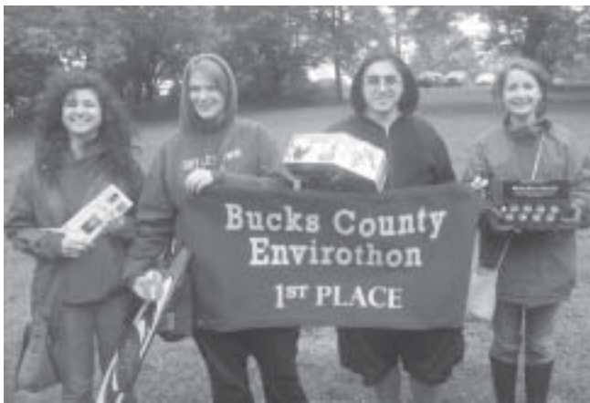
The First Place team was from Central Bucks East.