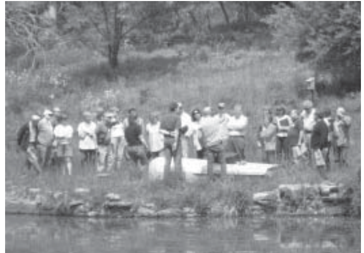
Workshop attendees visit the Audubon Pond at Honey Hollow.