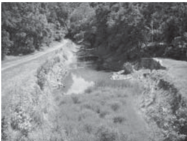
Flood damage to the canal and towpath at Lumberville.

The recent repairs made to the Delaware Canal were done as result of damages sustained following three separate flood events that occurred in September 2004, April 2005 and June 2006. The costly repairs and maintenance work required to preserve this National Historic Landmark is nothing new. Fraught with problems since its inception and initial construction in 1832, the Delaware Canal today retains almost all of its features as they existed during its heyday of commercial transportation.